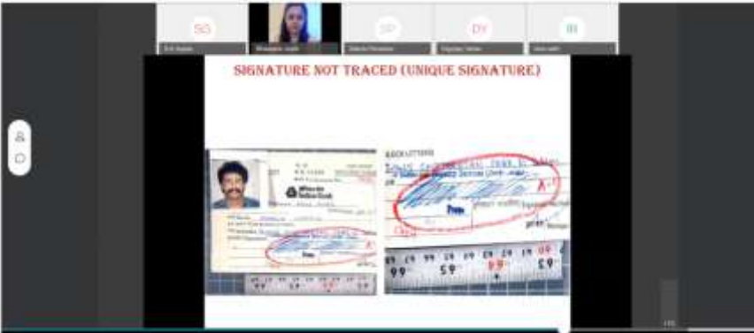
Pic-2:- Showing photography of traced forgery