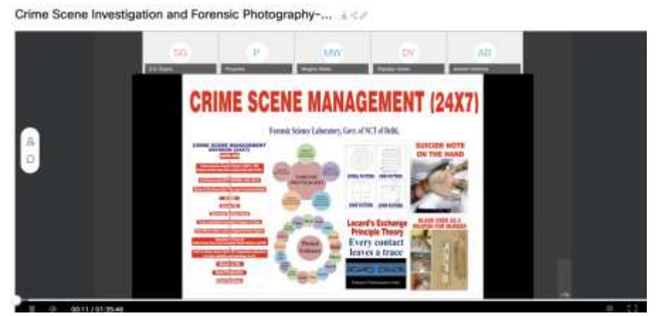
Pic-1: Showing Functional features of Crime Scene Management Division